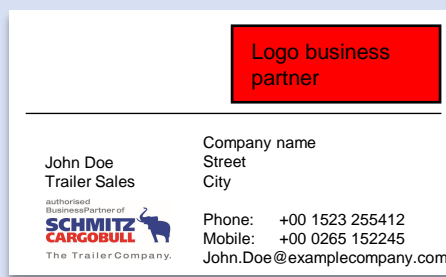
Example business card