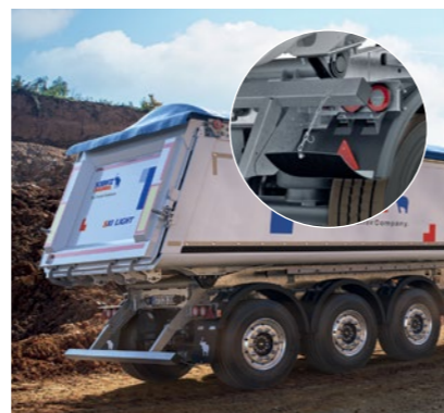
Foldable underide guard with high ground clearance for use on road pavers. Optionally manually operated, supported by spring mechanism or for improved handling in pneumatic version.