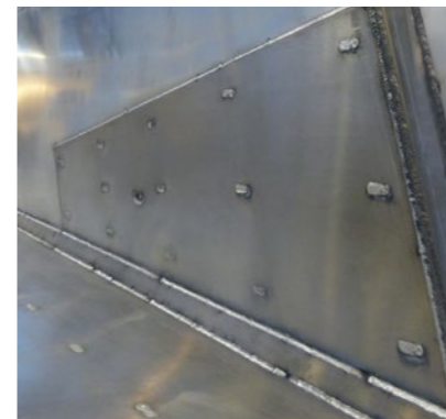
Wear plates optimise the resistance of the trough in the rear area.