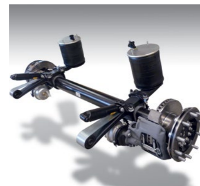
ROTOS axle units integrate high-quality components from renowned manufacturers. With MRH air suspension: ideal for lowering the centre of gravity when unloading. Even more robust, yet lighter.