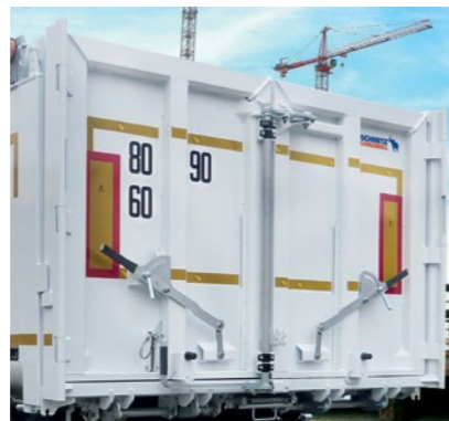
Combination door: with swing and door function. Optionally with slide.