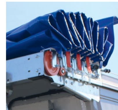
Sliding roof from Schmitz Cargobull enables time-saving opening and closing. Optionally available in manual or electric version, operated by remote control.