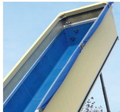
Plastic lining protects against wear, provides good sliding properties and reduces the risk of freezing.