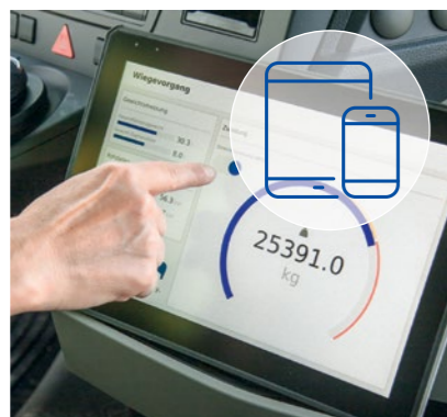
The innovative, calibratable on-board weighing system* determines the payload. The system can be operated intuitively either screen supplied or via the smartphone using the beSmart app.