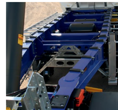
Torsion-resistant steel chassis with improved corrosion protection in painted or galvanised finish with best possible value retention.