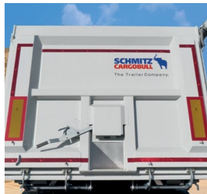
Surface-mounted pendulum flap - is suitable for partial unloading. Optionally with slide.