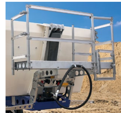
Working platform with anti-slip floor for operating the roller tarpaulin. Including troughand parking position for the hydraulic hose.