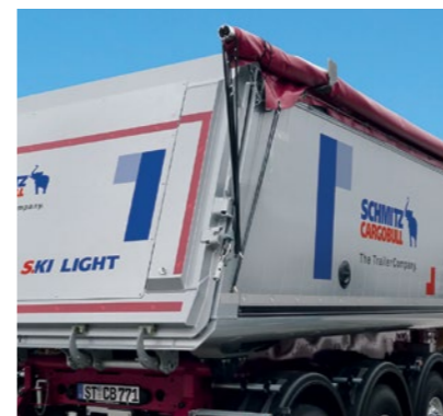
Thermo-insulated version* for asphalt transport. Measuring openings for manual, direct temperature measurement and preparation for the installation of electronic measuring technology.