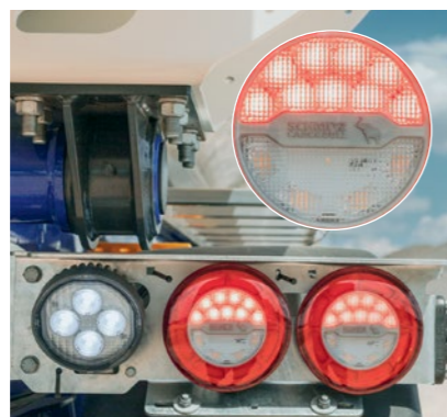
LED three-chamber lights in Schmitz Cargobull design. Multi-chamber lights with dynamic indicator. All rear lights in high lamp position as standard. LED work lights** for illuminating the dumping area.